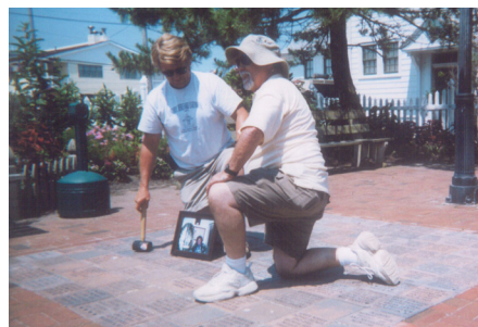
Pavers honoring our founder