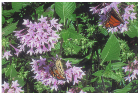
The Monarchs stop by